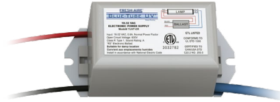
"ER" 18-24 VAC