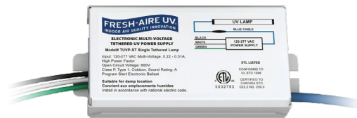
"ST" 110-277 VAC