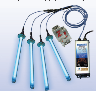
Single - Dual - Triple - Quad Lamp Systems

The power supply has an automatic switch to accept voltages from 120-277 VAC and comes with an unconditional lifetime power supply warranty.